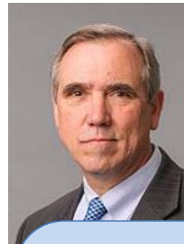
Sen. Jeff Merkley